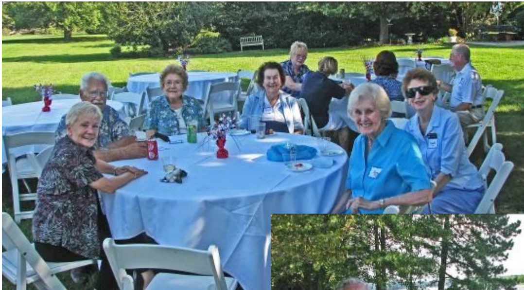
As usual, Bruce Lee was surrounded by beautiful women.

Here are some pictures of us enjoying the great food and friendly companionship.