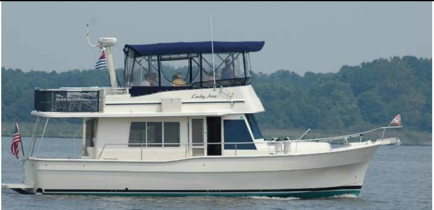
The Vass' Lady Anne carrying several MRSPS members on the Miles River Daytrip (2006)